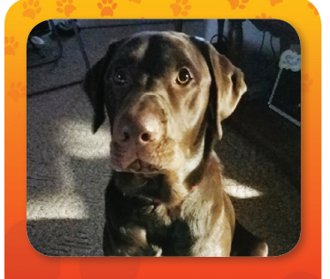
Owner: Nicole Aasved Name: Jagger Age: 2 Breed: Chocolate Lab