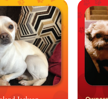
Name: Aspen Stevenson Jackson Age: 3 Breed: Chihuahua