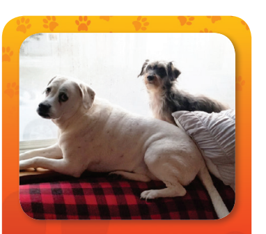
Owner: Darlene Chippewa Name: Sparkle & Murray Age: 13 &10 Breed: Boxer mix & Terrier mix