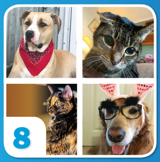
Rez Pets Tribal Members and employees highlight animal companions

Unemployment Guide Important information regarding applying for unemployment