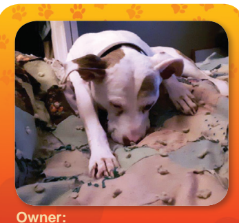
Kinomaage Kwe Spickerman Name: Pete Age: 11 Breed: Pit Bull