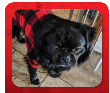
Owner: Tainelle Bailey Name: Brutus Age: 2 Breed: Chicahuahua/Pug mix