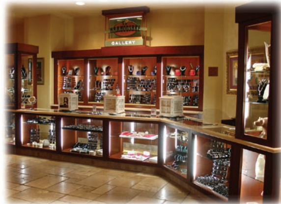
The new Naanooshke Gallery at the Soaring Eagle Casino & Resort