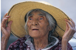
Laughter and Tears in the Caregiving Years

Participants are also welcome to register at the door.