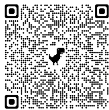
QR Code: Karma Kat Drag Bingo