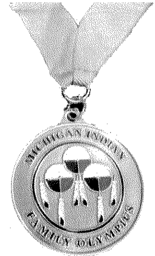
Mskwaa-bik Bronze Medal