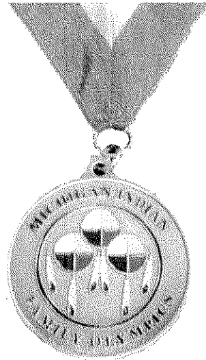
Bii-waa-bik Silver Medal