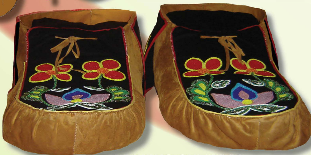
ZIIBIWING CHI MOCS

Co-Sponsored by: The Saginaw Chippewa Indian Tribe's Housing Department and Ziibiwing Center