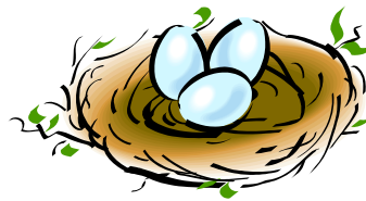
SASIWAANS means "Little Nest!"

in-class learning with real world opportunities to feel the language rise up from