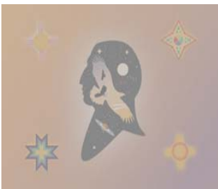
Assisting Native students in following their dreams

Behavioral Health Programs: School-Based Program Saginaw Chippewa Indian Tribe of Michigan 2800 S. Shepherd Mount Pleasant MI 48858